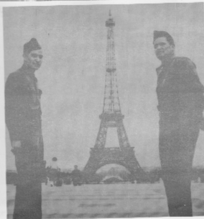
Left is ???